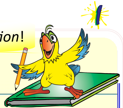
Student display for writing together

Write the introduction paragraph (below).